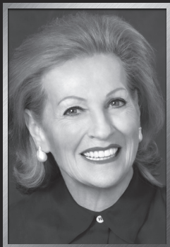
Paying tribute to Georgy Award Recipient

A spectacular fundraiser under the stars with world-class entertainment, fabulous food, and prestigious honors.