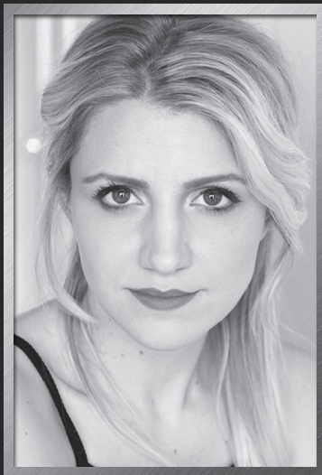
Special Performance by Tony® Award-Winner